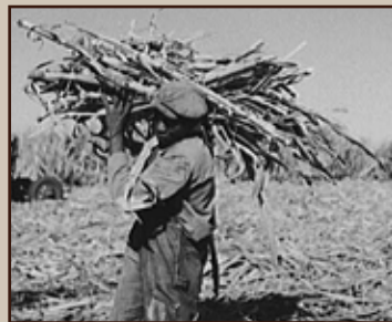
Cut sugarcane being carried to the trucks for the USSC (United States Sugar Corporation). Clewiston, Florida, 1939.

Unsurprisingly, forced labor took root in this climate, as well. In 1942, for example, the US Sugar Corporation and four of its managers were indicted on federal peonage charges for holding farmworkers against their will deep within the Everglades. Armed supervisors threatened to shoot workers, some of whom attempted to escape by swimming through canals, stowing aboard company trains, and crossing cane fields on foot. 17