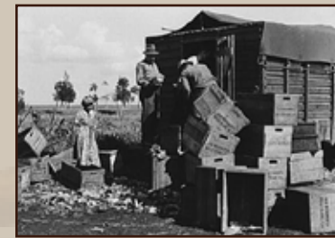
Trucker loading cabbages beside road near Belle Glade, Florida. 1939.

As the nineteenth century drew to a close, mid-Atlantic truck farmers began to sell greater quantities of fresh fruits and vegetables to urban markets. This model spread southward with the aid of rail lines and refrigeration technology, and in the 1920s, grower-shippers expanded citrus, sugarcane, and winter vegetable production in central and south Florida. These large-scale operations required a distinctly