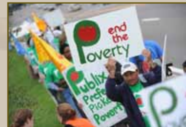
CIW members and allies march in Lakeland, Florida. 2009.

where its tomatoes are grown. Emblematic of this indifference has been the reaction of Florida's largest grocer (and the state's largest privately-held company), Publix.