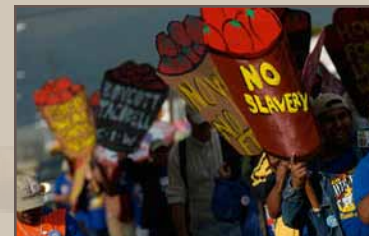
Coalition of Immokalee Workers' march from East Los Angeles to Irvine, CA. 2004.

In 2001, the CIW launched the Campaign for Fair Food, an innovative, worker-led campaign for the elimination of human rights violations in the US agricultural industry. The campaign identifies the links between the brutal farm labor conditions in US fields and the retail food giants that buy the produce grown in those fields. The high degree of consolidation in the food industry today means that multi-billion dollar brands on the retail end of the