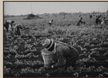
Picking beans. Belle Glade, Florida. 1937.