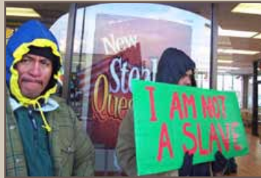
CIW members protest outside of a Taco Bell restaurant. 2002.

the tomato harvesting wage floor, establishing a voice for farmworkers in the agricultural industry, and enforcing the first-ever market consequences for growers that use forced labor. The power of this model was demonstrated in 2009 following sentencing in the case of U.S. vs. Navarrete. For the first time ever, a federal slavery conviction led to direct market consequences for the growers associated with the case, triggering the zero tolerance for slavery provisions in the CIW's agreements which caused the growers to lose business.