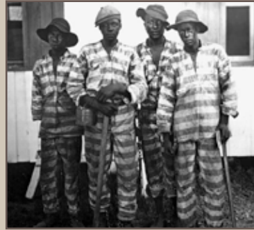
Convicts leased to harvest timber. 1910s.

interests sought to attract investment with the comparative advantage of a low-wage disenfranchised workforce. 6 These labor relations were maintained through the threat and actual use of violence. Between 1882 and 1930, black Floridians suffered the highest per capita lynching rate in the US with at least 266 killings, many linked to labor disputes. 7 Within a hardening Jim Crow racial caste system, forced labor persisted in a combination of legally sanctioned and extra-legal forms.