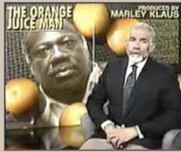
Originally aired January 3, 1993.

laws forbidding peonage and indentured servitude passed just after the Civil War during Reconstruction (18 U.S.C. Sections 1581-1589) and the 2000 Victims of Trafficking and Violence Protection Act. In such situations, captive workers are held against their will by their employers through threats and, all too often, the actual use of violence – including beatings, shootings, and pistol-whippings. The seven most recent prosecutions resulted in the liberation of well over 1,000 farmworkers: